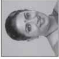
स्मृति इरानी संघीय मंत्रालय विकास