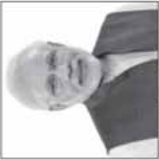
नरेन्द्र मोदी राज्यपाल मंत्री